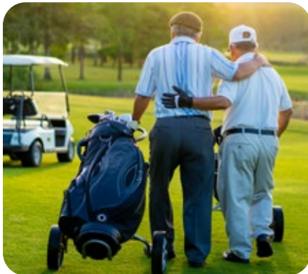
24 Hour Fitness LA Fitness Golf

Staying active is an important part of staying healthy. Whether you're meeting friends for a round of golf, getting in an early morning swim, or taking Zumba classes at the gym, it all adds up to a healthy you! With Clever Care, our fitness benefit is more than just a gym membership. Did you know you can use your flexible allowance to pay for the following fitness activities?