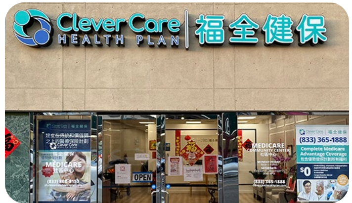
Monterey Park 117 West Garvey Ave. #C Monterey Park, CA 91754