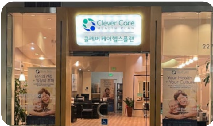
Koreatown 928 South Western Ave. Suite 227 Los Angeles, CA 90006

We welcome you to drop into any one of our centers to connect with friends or participate in group events such as yoga or tai chi. Or stop by to enjoy a cup of tea and learn more about our Medicare plans.