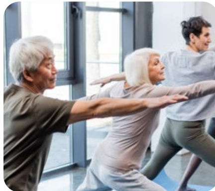
Yoga Pilates Tai chi