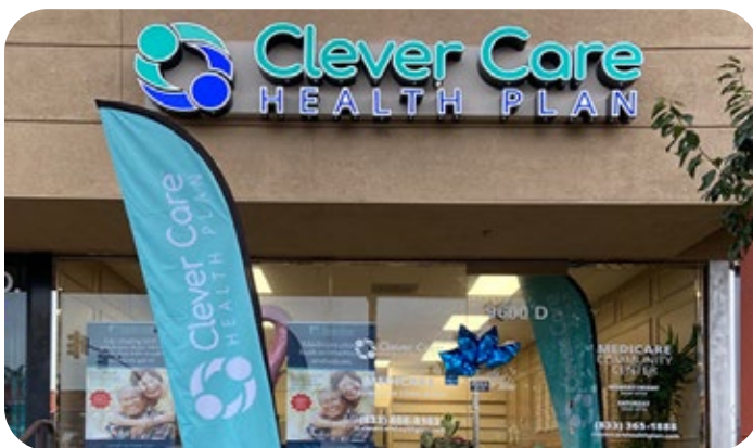
Westminster 9600 Bolsa Ave. Suite D&I Westminster, CA 92683