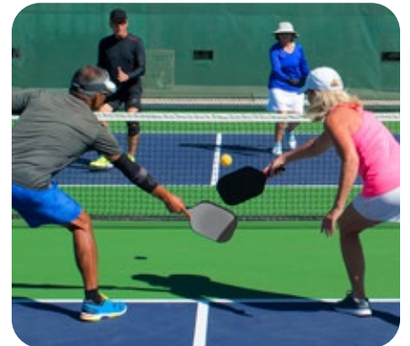
Swimming, water aerobics Tennis, pickleball, table tennis Dancing classes

Choose how you want to spend your flex benefits. Clever Care's flex card puts you in charge.